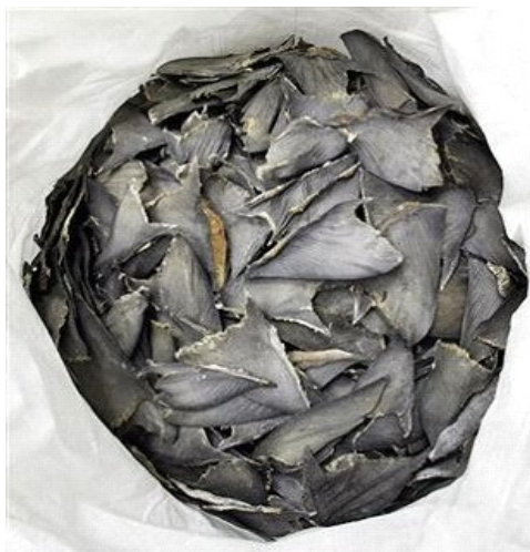
Shark fins await delivery.